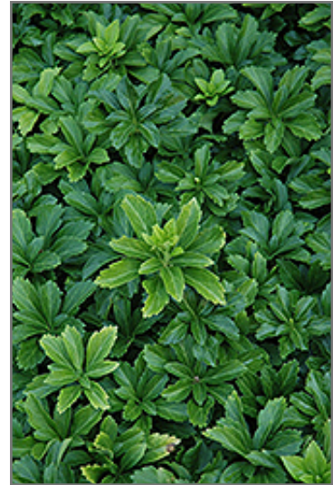
Green Sheen Japanese Spurge foliage