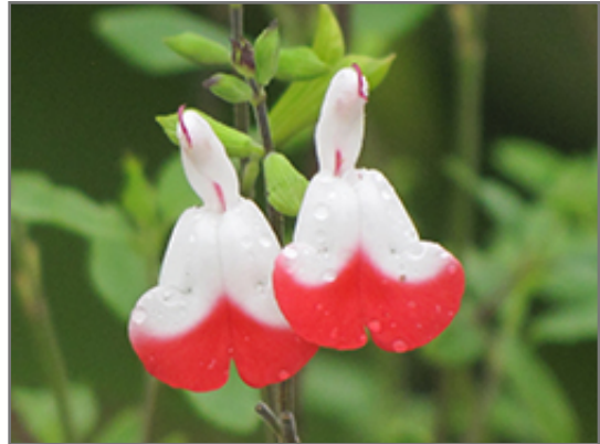
Hot Lips Sage flowers

This is a relatively low maintenance plant, and should only be pruned after flowering to avoid removing any of the current season's flowers. It is a good choice for attracting bees, butterflies and hummingbirds to your yard, but is not particularly attractive to deer who tend to leave it alone in favor of tastier treats. It has no significant negative characteristics.