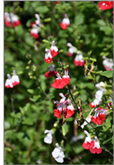
Hot Lips Sage flowers

Hot Lips Sage is a fine choice for the garden, but it is also a good selection for planting in outdoor pots and containers. With its upright habit of growth, it is best suited for use as a 'thriller' in the 'spiller-thriller-filler' container combination; plant it near the center of the pot, surrounded by smaller plants and those that spill over the edges. It is even sizeable enough that it can be grown alone in a suitable container. Note that when growing plants in outdoor containers and baskets, they may require more frequent waterings than they would in the yard or garden.