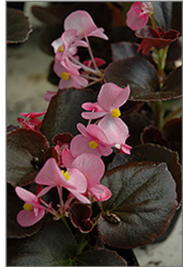
Cocktail Gin Begonia flowers

Cocktail Gin Begonia is recommended for the following landscape applications;