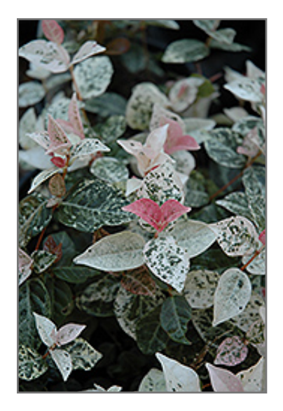
Snow N Summer Star-Jasmine foliage

Snow N Summer Star-Jasmine will grow to be about 20 feet tall at maturity, with a spread of 24 inches. As a climbing vine, it tends to be leggy near the base and should be underplanted with low-growing facer plants. It should be planted near a fence, trellis or other landscape structure where it can be trained to grow upwards on it, or allowed to trail off a retaining wall or slope. It grows at a slow rate, and under ideal conditions can be expected to live for approximately 20 years.