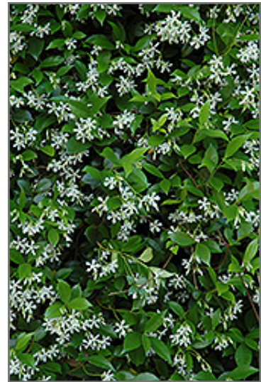
Confederate Star-Jasmine flowers