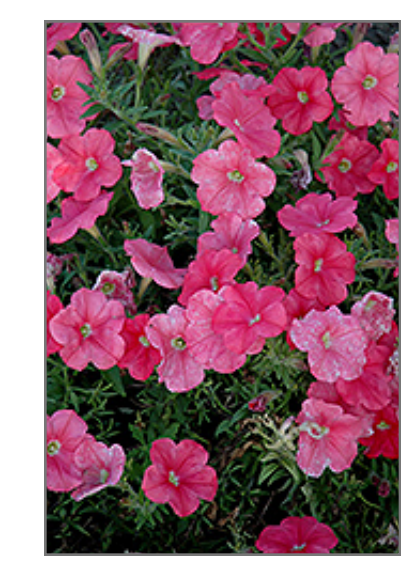
Madness Simply Petunia flowers

Madness Simply Petunia will grow to be about 14 inches tall at maturity, with a spread of 12 inches. When grown in masses or used as a bedding plant, individual plants should be spaced approximately 10 inches apart. Its foliage tends to remain dense right to the ground, not requiring facer plants in front. This fast-growing annual will normally live for one full growing season, needing replacement the following year.