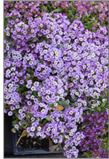
Clear Crystal Lavender Shades Sweet Alyssum flowers

Clear Crystal Lavender Shades Sweet Alyssum is recommended for the following landscape applications;