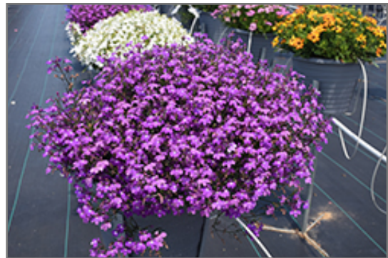
Techno Violet Lobelia in bloom