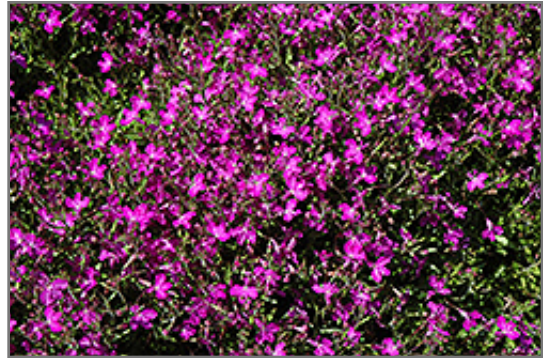
Techno Violet Lobelia flowers

Techno Violet Lobelia will grow to be about 8 inches tall at maturity, with a spread of 12 inches. When grown in masses or used as a bedding plant, individual plants should be spaced approximately 10 inches apart. Its foliage tends to remain low and dense right to the ground. Although it's not a true annual, this fast-growing plant can be expected to behave as an annual in our climate if left outdoors over the winter, usually needing replacement the following year. As such, gardeners should take into consideration that it will perform differently than it would in its native habitat.