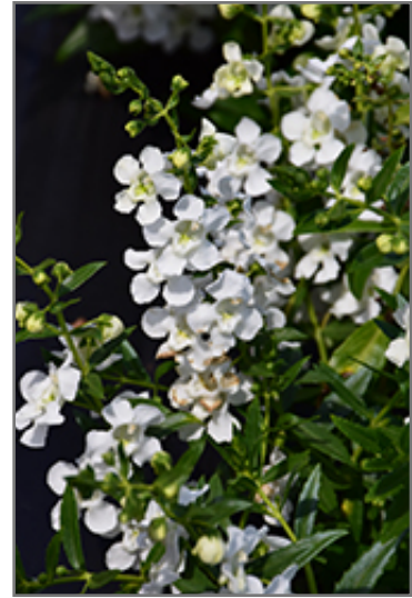
AngelMist Spreading White Angelonia flowers

This plant will require occasional maintenance and upkeep, and should not require much pruning, except when necessary, such as to remove dieback. It is a good choice for attracting butterflies to your yard, but is not particularly attractive to deer who tend to leave it alone in favor of tastier treats. It has no significant negative characteristics.