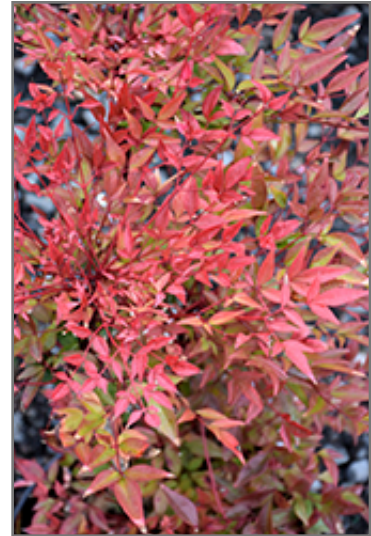
Obsession Nandina foliage