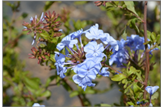
Imperial Blue Plumbago flowers

Imperial Blue Plumbago is recommended for the following landscape applications;