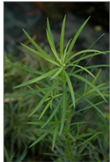
Shubby Podocarpus foliage