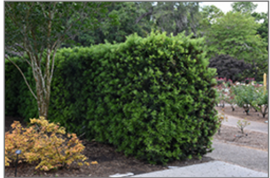
Shrubby Podocarpus

This shrub does best in full sun to partial shade. It does best in average to evenly moist conditions, but will not tolerate standing water. It may require supplemental watering during periods of drought or extended heat. It is not particular as to soil type or pH. It is highly tolerant of urban pollution and will even thrive in inner city environments. This is a selected variety of a species not originally from North America.