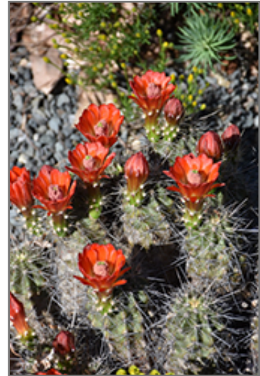
Mexican Claret Cup (Scarlet Hedgehog Cactus) flowers

This is a relatively low maintenance plant, and should never be pruned except to remove any dieback, as it tends not to take pruning well. Deer don't particularly care for this plant and will usually leave it alone in favor of tastier treats. Gardeners should be aware of the following characteristic(s) that may warrant special consideration;