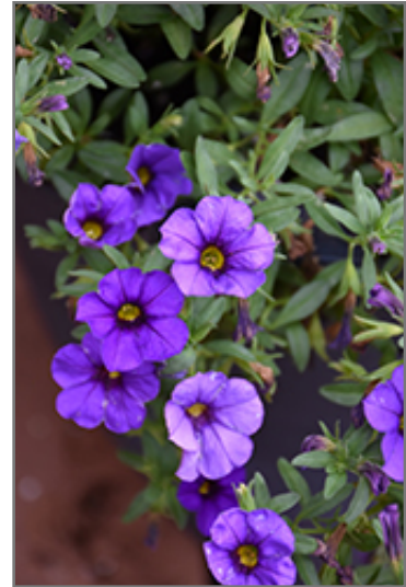
Aloha Kona Midnight Blue Calibrachoa flowers

Aloha Kona Midnight Blue Calibrachoa is recommended for the following landscape applications;