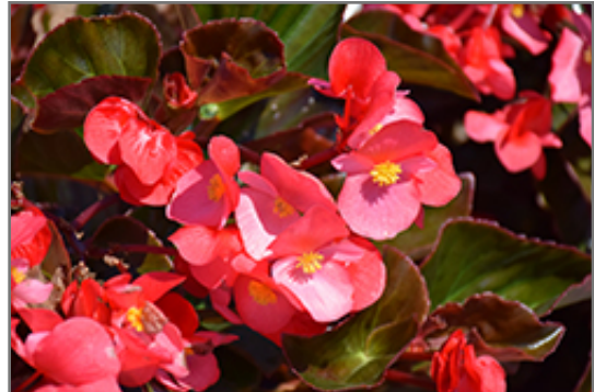
Whopper Rose Bronze Leaf Begonia flowers