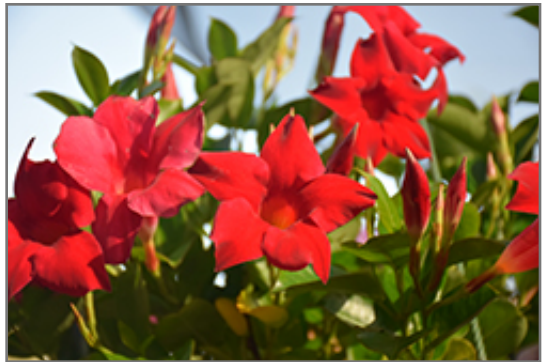
Sun Parasol Crimson Mandevilla flowers

This plant is native to the tropics and prefers growing in moist environments with evenly warm conditions all year round. In our climate, it is usually grown as an outdoor annual in the garden or in a container. If you want it to survive the winter, it can be brought in to the house and provided with special care, and then returned to the garden the following season. In its preferred tropical habitat, as a shrub it can grow to be around 10 feet tall at maturity, with a spread of 24 inches. However, when grown as an annual or when overwintered indoors, it can be expected to perform quite differently, and its exact height and spread will depend on many factors; you may wish to consult with our experts as to how it might perform in your specific application and growing conditions.