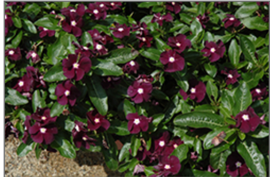
Jams 'N Jellies Blackberry Vinca flowers

Jams 'N Jellies Blackberry Vinca is recommended for the following landscape applications;