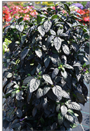
Black Pearl Ornamental Pepper