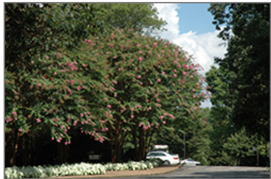
Miami Crapemyrtle in bloom