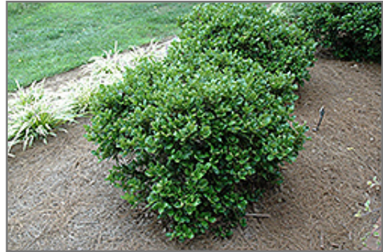
Carissa Holly

Carissa Holly is recommended for the following landscape applications;