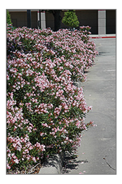
Petite Pink Oleander in bloom

This shrub does best in full sun to partial shade. It is very adaptable to both dry and moist locations, and should do just fine under average home landscape conditions. It is considered to be drought-tolerant, and thus makes an ideal choice for xeriscaping or the moisture-conserving landscape. It is not particular as to soil pH, but grows best in poor soils, and is able to handle environmental salt. It is highly tolerant of urban pollution and will even thrive in inner city environments. This is a selected variety of a species not originally from North America, and parts of it are known to be toxic to humans and animals, so care should be exercised in planting it around children and pets.