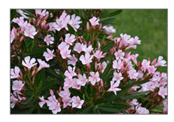
Petite Pink Oleander flowers

Petite Pink Oleander is recommended for the following landscape applications;