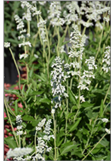
Augusta Duelberg Salvia flowers

Augusta Duelberg Salvia is recommended for the following landscape applications;