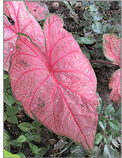
Fannie Munson Caladium foliage

Fannie Munson Caladium is recommended for the following landscape applications;