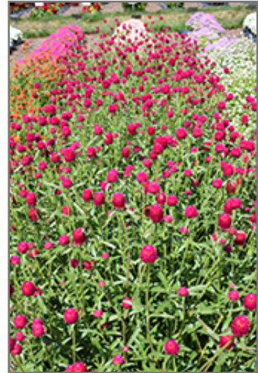
Qis Carmine Gomphrena in bloom

Qis Carmine Gomphrena is a fine choice for the garden, but it is also a good selection for planting in outdoor pots and containers. With its upright habit of growth, it is best suited for use as a 'thriller' in the 'spiller-thriller-filler' container combination; plant it near the center of the pot, surrounded by smaller plants and those that spill over the edges. Note that when growing plants in outdoor containers and baskets, they may require more frequent waterings than they would in the yard or garden.