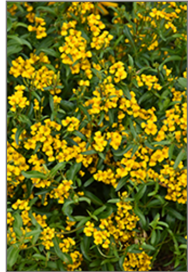
Mexican Tarragon flowers

Mexican Tarragon features showy yellow daisy flowers with gold eyes at the ends of the stems from late summer to early fall. Its attractive fragrant narrow compound leaves remain green in color throughout the season.