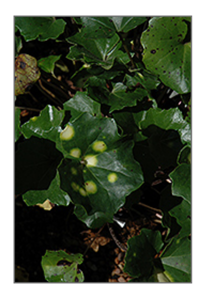
Leopard Plant foliage