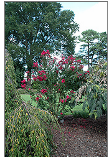
Pink Velour Crapemyrtle in bloom