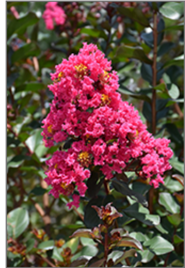
Pink Velour Crapemyrtle flowers