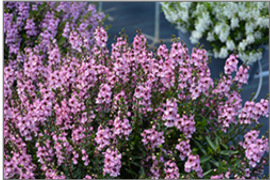
Serenita Pink Angelonia in bloom