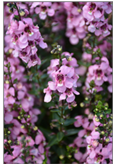
Serenita Pink Angelonia flowers