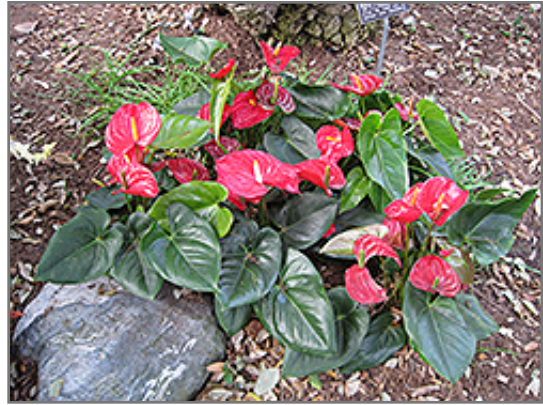
Anthurium flowers

Anthurium is recommended for the following landscape applications;