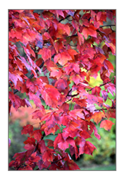
Red Maple in fall