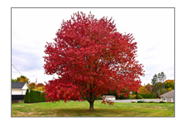
Red Maple in fall