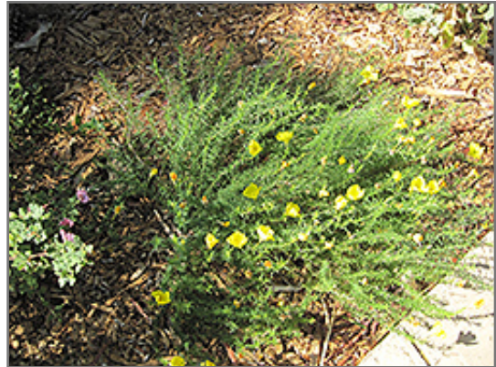
Hartweg's Sundrops in bloom