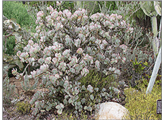
Silver Dollar Plant

Silver Dollar Plant is recommended for the following landscape applications;