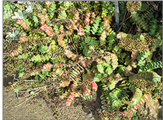
String Of Buttons

String Of Buttons is recommended for the following landscape applications;