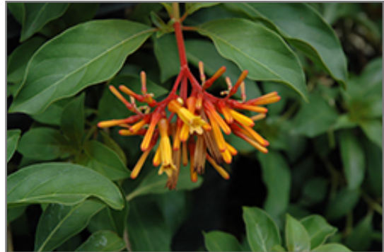
Dwarf Firebush flowers