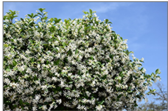
Madison Star-Jasmine flowers