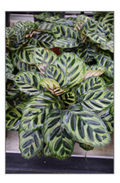
Peacock Plant in full

When grown indoors, Peacock Plant can be expected to grow to be about 24 inches tall at maturity, with a spread of 18 inches. It grows at a slow rate, and under ideal conditions can be expected to live for approximately 5 years. This houseplant should only be grown away from direct sunlight or in a room with strong artificial light. It does best in average to evenly moist soil, but will not tolerate standing water. The surface of the soil shouldn't be allowed to dry out completely, and so you should expect to water this plant once and possibly even twice each week. Be aware that your particular watering schedule may vary depending on its location in the room, the pot size, plant size and other conditions; if in doubt, ask one of our experts in the store for advice. It is not particular as to soil pH, but grows best in rich soil. Contact the store for specific recommendations on pre-mixed potting soil for this plant.