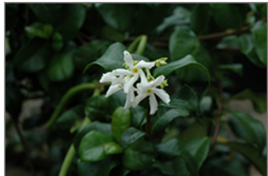
Madison Star-Jasmine flowers