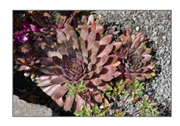
Kalinda Hens And Chicks

When grown indoors, Kalinda Hens And Chicks can be expected to grow to be only 4 inches tall at maturity extending to 12 inches tall with the flowers, with a spread of 12 inches. It grows at a medium rate, and under ideal conditions can be expected to live for approximately 20 years. This houseplant requires direct sun for optimal performance, and should therefore be situated in a room that gets bright sunlight for a good part of the day; it is not a good choice for rooms lit only by artificial light. It prefers dry to average moisture levels with very well-drained soil, and may die if left in standing water for any length of time. This plant should be watered when the surface of the soil gets dry, and will need watering approximately once each week. Be aware that your particular watering schedule may vary depending on its location in the room, the pot size, plant size and other conditions; if in doubt, ask one of our experts in the store for advice. It is not particular as to soil pH, but grows best in sandy soil. Contact the store for specific recommendations on pre-mixed potting soil for this plant.