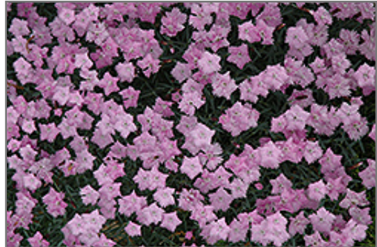
Bath's Pink Pinks in bloom

Bath's Pink Pinks is recommended for the following landscape applications;