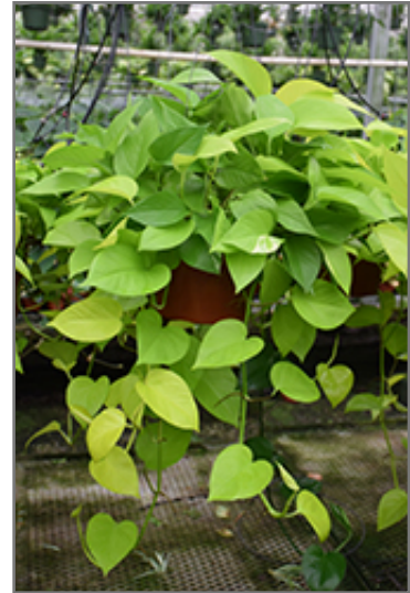
Neon Pothos in full

When grown indoors, Neon Pothos can be expected to grow to be about 5 feet tall at maturity, with a spread of 24 inches. It grows at a fast rate, and under ideal conditions can be expected to live for approximately 10 years. This houseplant performs well in both bright or indirect sunlight and strong artificial light, and can therefore be situated in almost any well-lit room or location. It does best in average to evenly moist soil, but will not tolerate standing water. The surface of the soil shouldn't be allowed to dry out completely, and so you should expect to water this plant once and possibly even twice each week. Be aware that your particular watering schedule may vary depending on its location in the room, the pot size, plant size and other conditions; if in doubt, ask one of our experts in the store for advice. It is not particular as to soil type or pH; an average potting soil should work just fine. Be warned that parts of this plant are known to be toxic to humans and animals, so special care should be exercised if growing it around children and pets.