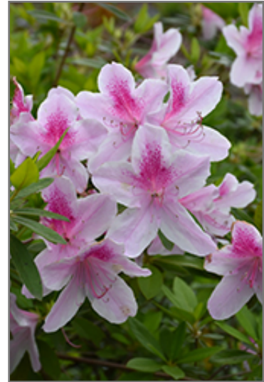
George Lindley Taber Azalea flowers