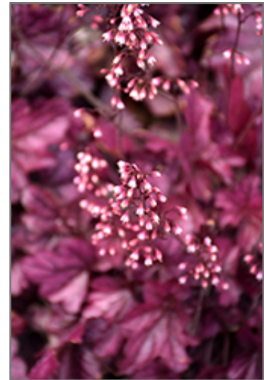
Wild Rose Coral Bells flowers