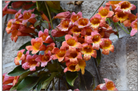
Tangerine Beauty Cross Vine flowers

This woody vine does best in full sun to partial shade. It is very adaptable to both dry and moist growing conditions, but will not tolerate any standing water. It may require supplemental watering during periods of drought or extended heat. It is not particular as to soil type, but has a definite preference for acidic soils. It is highly tolerant of urban pollution and will even thrive in inner city environments. This is a selection of a native North American species.