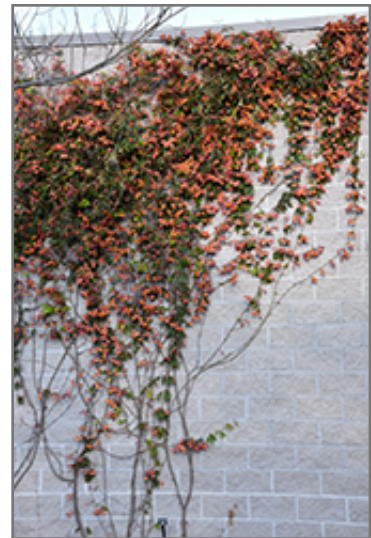
Tangerine Beauty Cross Vine in bloom