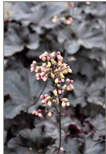
Black Pearl Coral Bells flowers