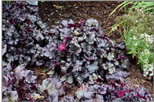
Black Pearl Coral Bells

Black Pearl Coral Bells will grow to be about 10 inches tall at maturity extending to 20 inches tall with the flowers, with a spread of 26 inches. When grown in masses or used as a bedding plant, individual plants should be spaced approximately 20 inches apart. Its foliage tends to remain low and dense right to the ground. It grows at a medium rate, and under ideal conditions can be expected to live for approximately 10 years. As an evergreen perennial, this plant will typically keep its form and foliage year-round.