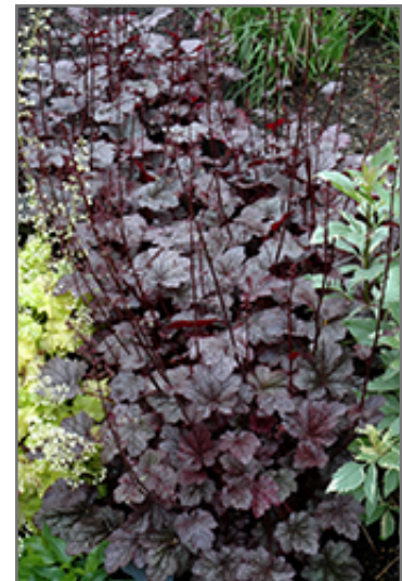
Plum Pudding Coral Bells in bloom