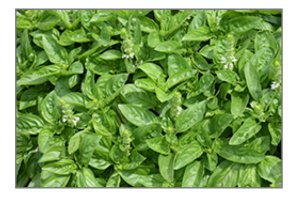
Dolce Fresca Basil foliage

Dolce Fresca Basil will grow to be about 14 inches tall at maturity, with a spread of 14 inches. When grown in masses or used as a bedding plant, individual plants should be spaced approximately 12 inches apart. This fast-growing annual will normally live for one full growing season, needing replacement the following year.