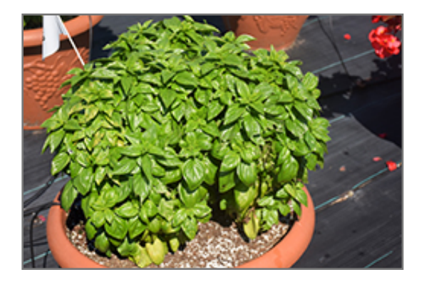
Dolce Fresca Basil

* This is a 'special order' plant - contact store for details