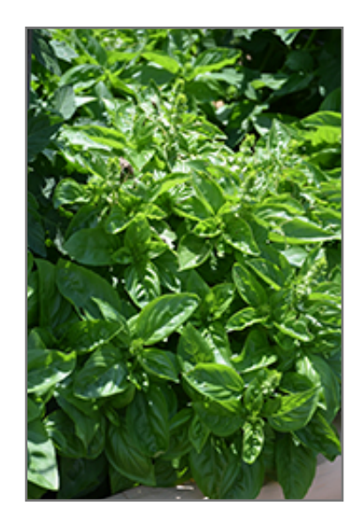
Dolce Fresca Basil