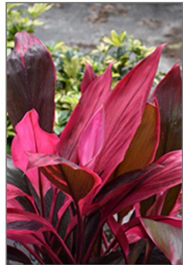
Red Sister Hawaiian Ti Plant foliage