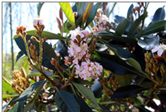
Coppertone Loquat flowers