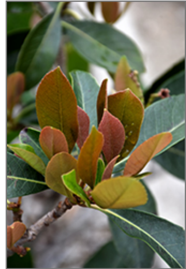
Coppertone Loquat foliage

Coppertone Loquat is a good choice for the edible garden, but it is also well-suited for use in outdoor pots and containers. Its large size and upright habit of growth lend it for use as a solitary accent, or in a composition surrounded by smaller plants around the base and those that spill over the edges. It is even sizeable enough that it can be grown alone in a suitable container. Note that when grown in a container, it may not perform exactly as indicated on the tag - this is to be expected. Also note that when growing plants in outdoor containers and baskets, they may require more frequent waterings than they would in the yard or garden.