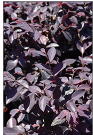
Cherry Blast Fringeflower foliage