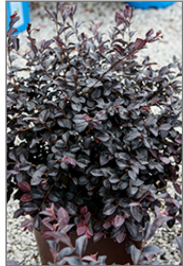
Cherry Blast Fringeflower

Cherry Blast Fringeflower makes a fine choice for the outdoor landscape, but it is also well-suited for use in outdoor pots and containers. Because of its height, it is often used as a 'thriller' in the 'spiller-thriller-filler' container combination; plant it near the center of the pot, surrounded by smaller plants and those that spill over the edges. It is even sizeable enough that it can be grown alone in a suitable container. Note that when grown in a container, it may not perform exactly as indicated on the tag - this is to be expected. Also note that when growing plants in outdoor containers and baskets, they may require more frequent waterings than they would in the yard or garden.