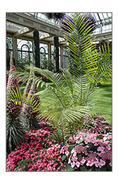
Majesty Palm

When grown indoors, Majesty Palm can be expected to grow to be about 10 feet tall at maturity, with a spread of 5 feet. It grows at a fast rate, and under ideal conditions can be expected to live for approximately 20 years. This houseplant performs well in both bright or indirect sunlight and strong artificial light, and can therefore be situated in almost any well-lit room or location. It does best in average to evenly moist soil, but will not tolerate standing water. The surface of the soil shouldn't be allowed to dry out completely, and so you should expect to water this plant once and possibly even twice each week. Be aware that your particular watering schedule may vary depending on its location in the room, the pot size, plant size and other conditions; if in doubt, ask one of our experts in the store for advice. It is not particular as to soil pH, but grows best in rich soil. Contact the store for specific recommendations on pre-mixed potting soil for this plant.